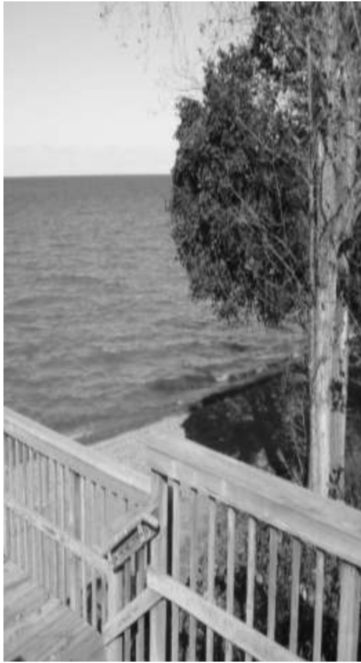
Wilson, New York