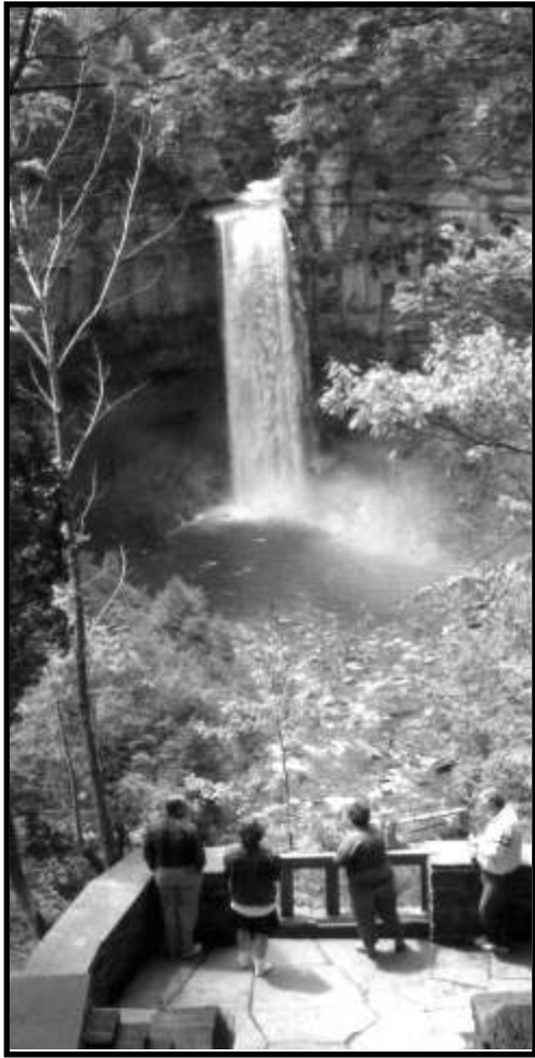
Trumansburg, New York