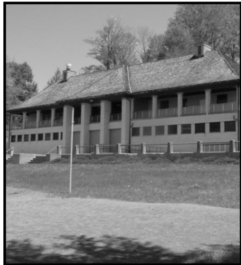
Bemus Point, New York