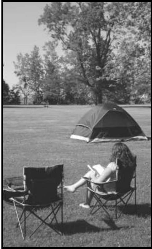
Youngstown, New York