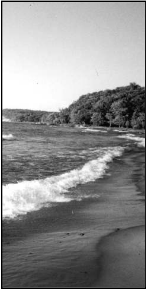
Fair Haven, New York