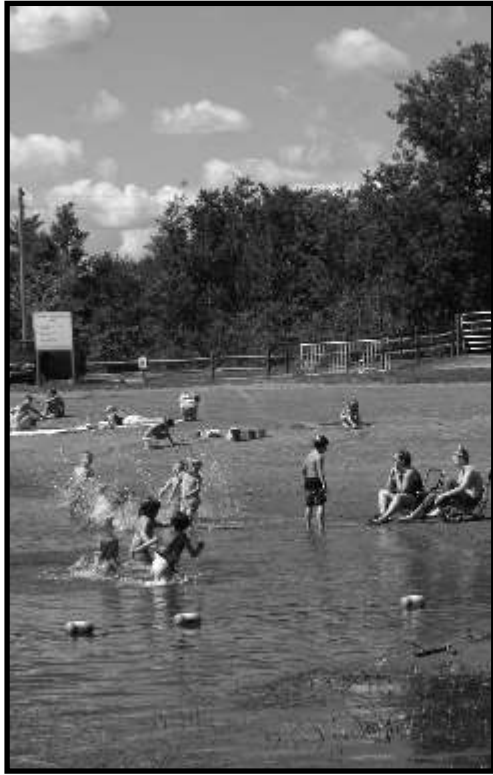
Darien Center, New York