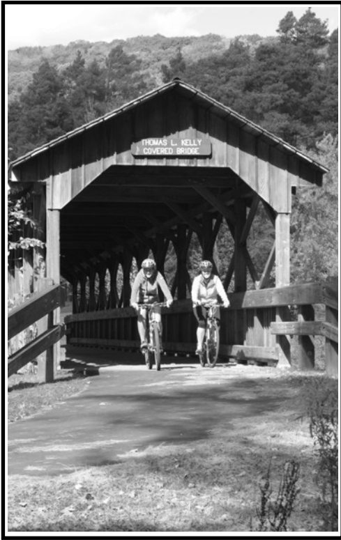
Salamanca, New York